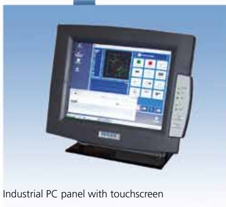
Industrial PC panel with touchscreen