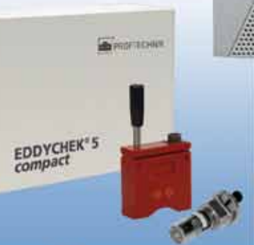
Segment coil & E probe